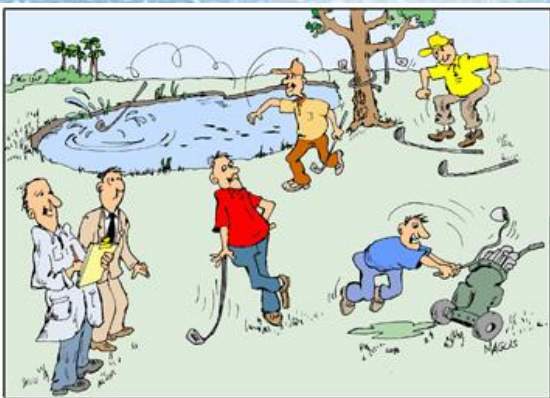
Our thorough testing of clubs includes all of the possible ways it might be used during a normal round.

"There's no such thing as bad weather, only inappropriate clothing."